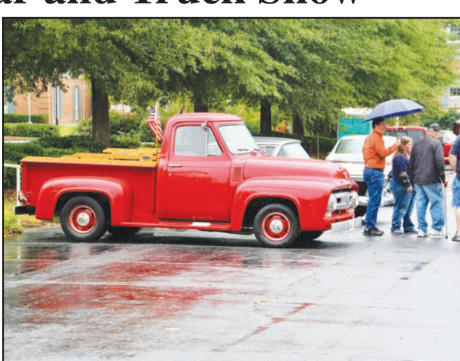
Rainy weather definitely put a damper on turnout for the final Good Neighbors Auto Club Car and Truck Show, but many die-hard car enthusiasts showed up anyway.

For those who don't recall, the first show was in 1984, though the club actually started in 1983. Now in its 34th year, the show spent its first year at Union County High School before moving to the Old Milton Inn for two years.