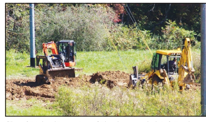
City of Blairsville workers filling in a repair job following an Oct. 17 water main break in this field off Woodside Drive.

Fortunately, the city was able to quickly locate and repair