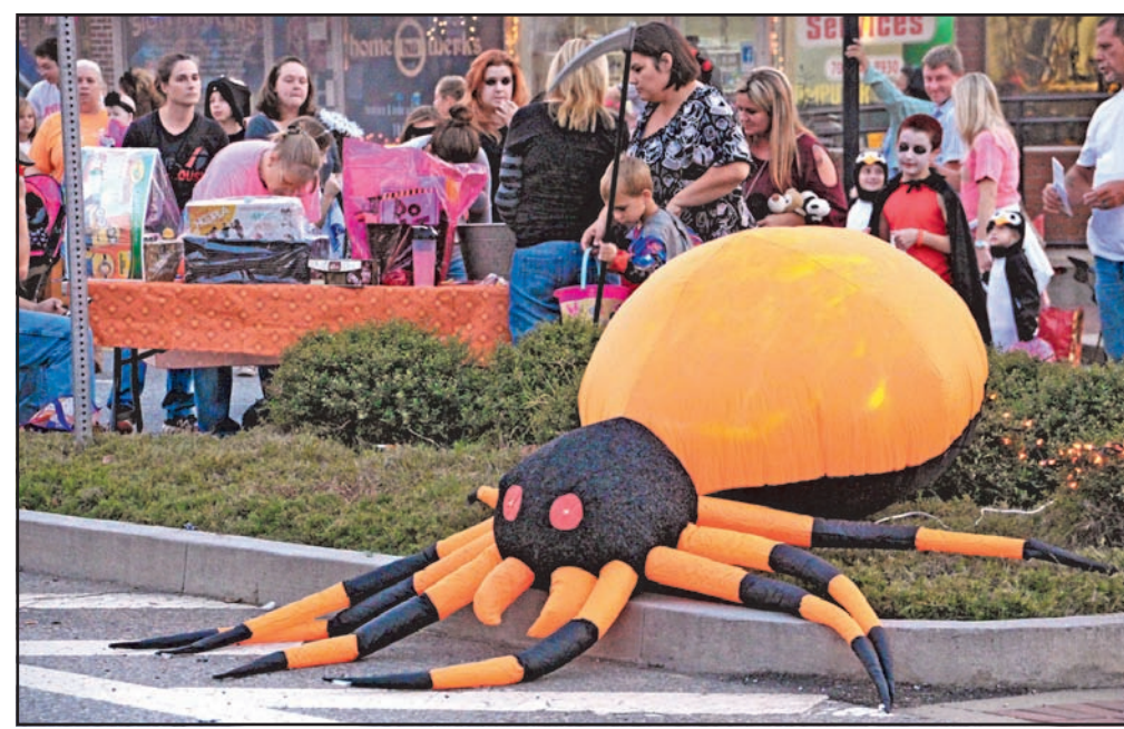
A view from a past Hometown Halloween on the Square, which will take place as it does every year on Oct. 31 in Downtown Blairsville. Happy Halloween! year on Oct. 31 in Downtown Blairsville. Happy Halloween!