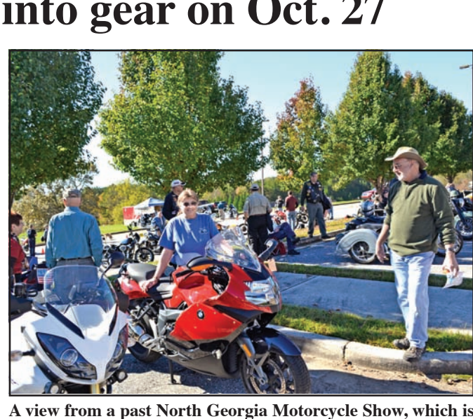
always a good family-friendly event in the mountains.

featuring the following nine See Motorcycle Show, Page 6A